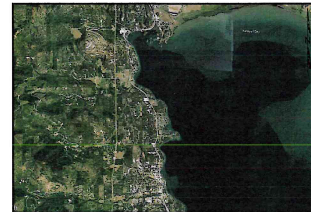
SITE LOCATION MAP NOT TO SCALE